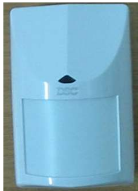
Infrared Motion Detector